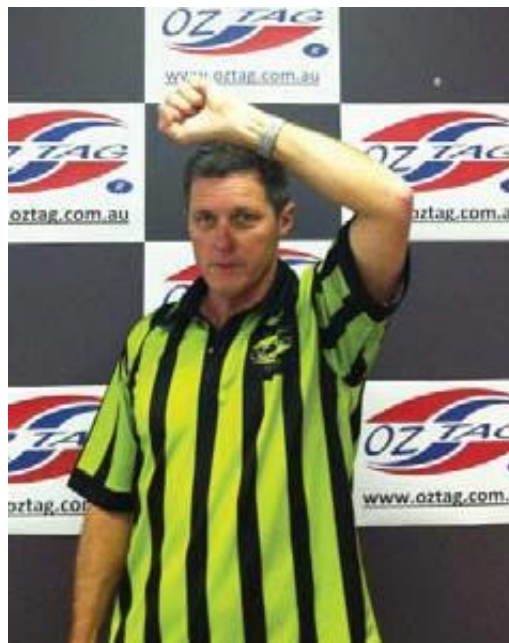
6 again – Stage 1