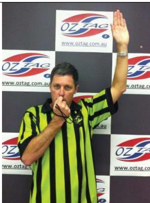
Kick off - commence game