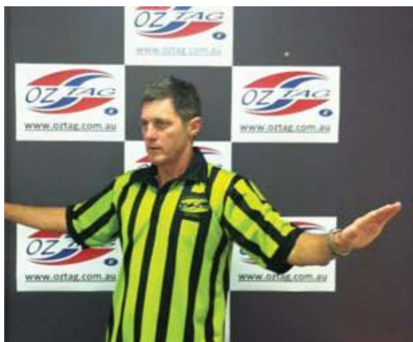
End of game – Stage 2