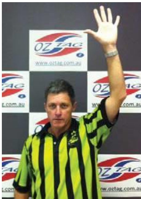
5 th & last