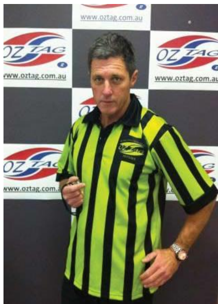
Late Tag – Stage 1