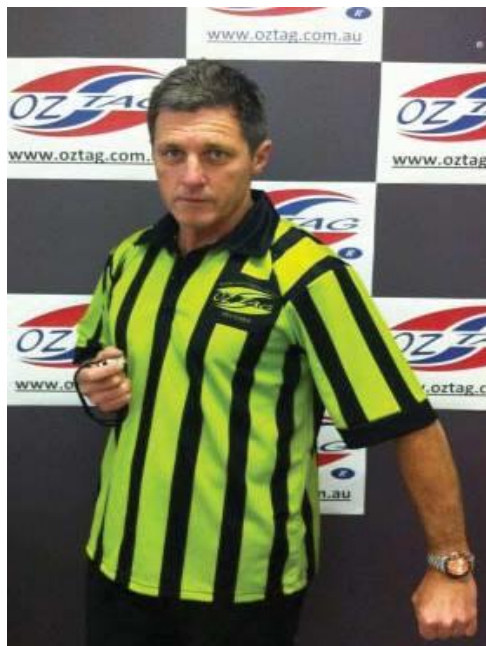
Late Tag – Stage 2