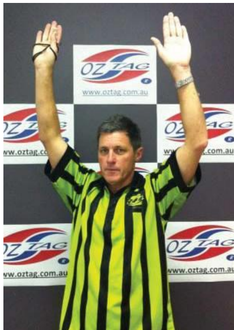
Stop Play – Stage 2