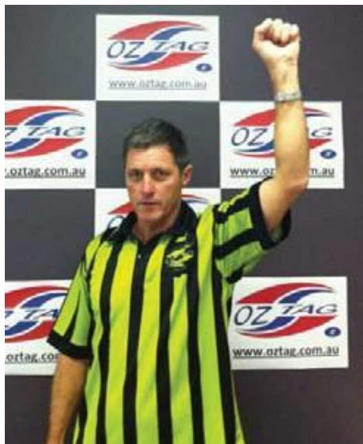
6 again – Stage 1