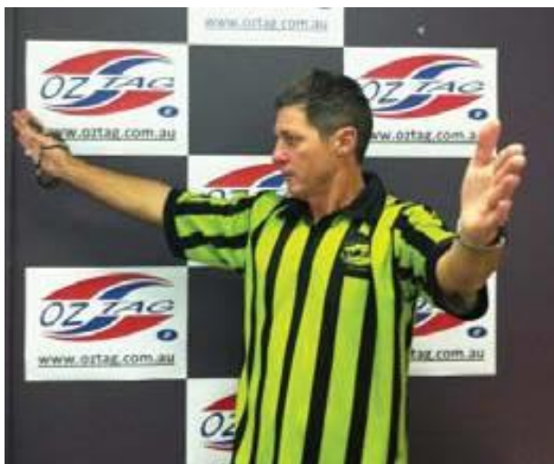
Offside – Stage 3