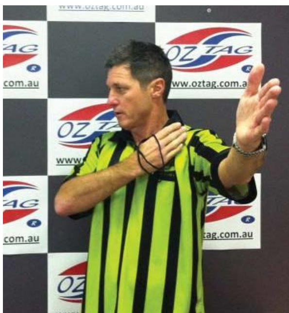
Offside – Stage 1