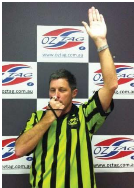
Stop Play – Stage 1