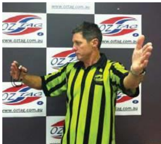
Offside – Stage 2