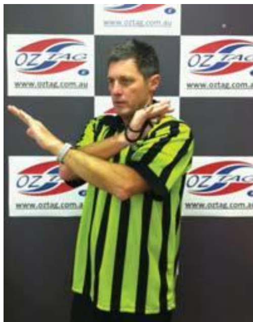
End of game – Stage 1